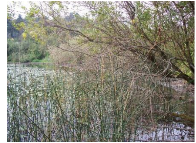
Lake Washington shoreline and associated wetlands