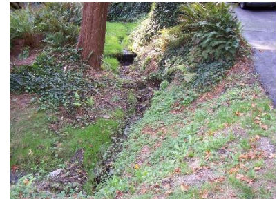
Seasonal watercourse in existing residential neighborhood